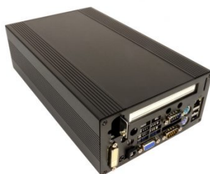
LPC-480PCIG4 Front View