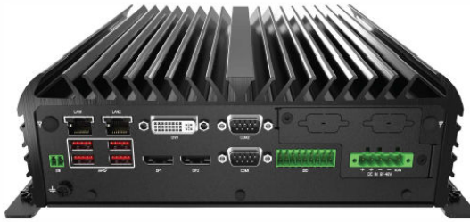
LPC 870 Back view